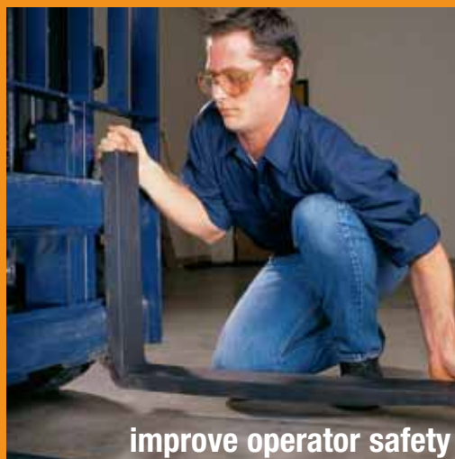
improve operator safety